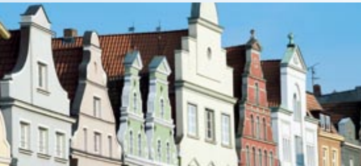
Historical house fronts in the Hanseatic town of Wismar

Should you be interested we request you register at the State of Mecklenburg-Western Pomerania's information stand (in the lobby of the international media center). On request you will also receive detailed information about the programme.