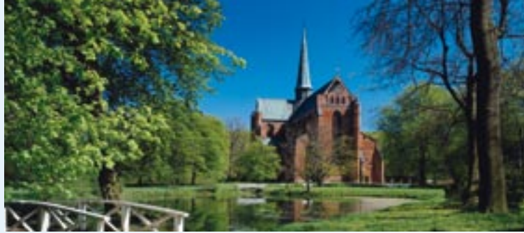
Minster, Bad Doberan